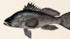
Black Sea Bass ▲◆◆