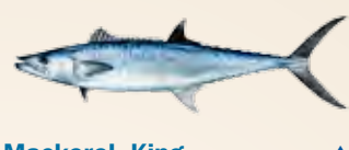
Mackerel, King ▲