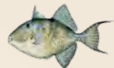
Triggerfish (Gray) ▲◆X