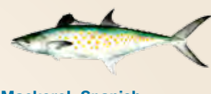
Mackerel, Spanish ▲