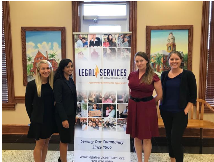
Stanford Law Students provided valuable volunteer legal assistance with local volunteer lawyers at the Key Largo and Marathon Legal Clinics, made possible by UWCK support to Legal Services of Greater Miami.