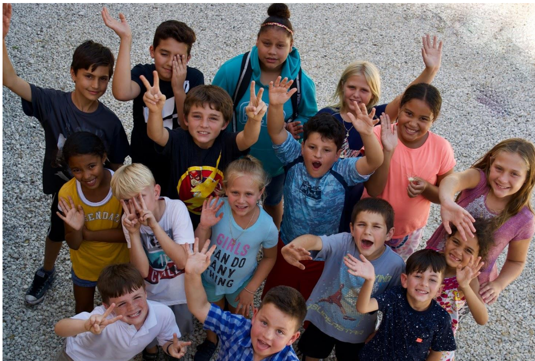
Hammock House in Marathon provides quality, safe after school and summer childcare with support made possible by UWCK.