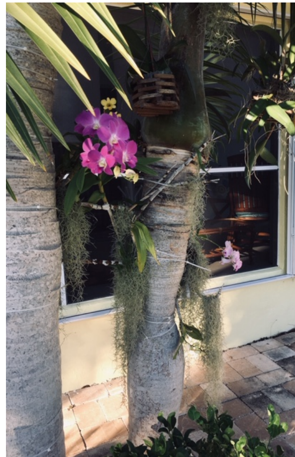
Dendrobiums on Cudjoe